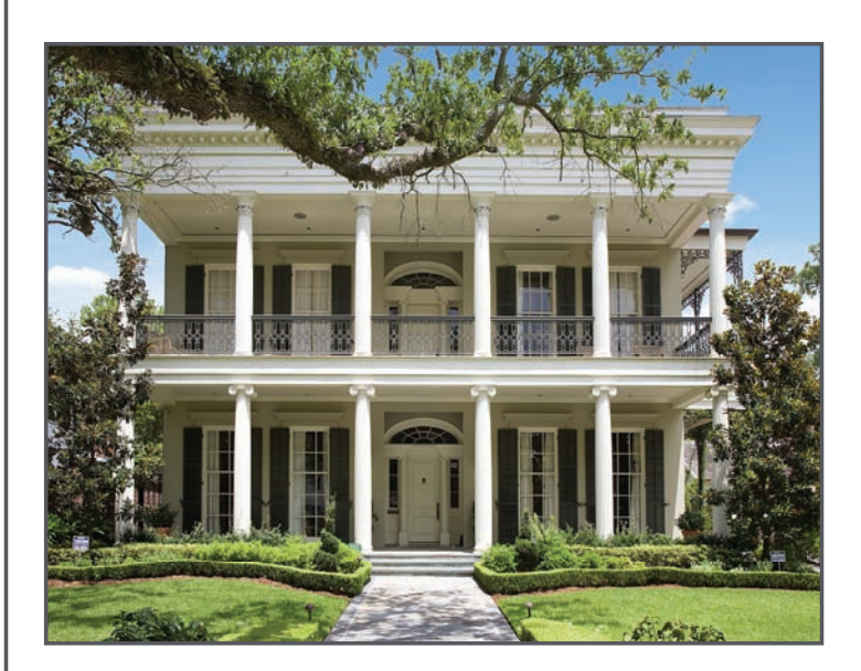
Experienced, Custom Design Service Specializing in Residential Homes

504.269.0509 · 1118 Cadiz Street · New Orleans, LA 70115 sonnerdesigns@cox.net